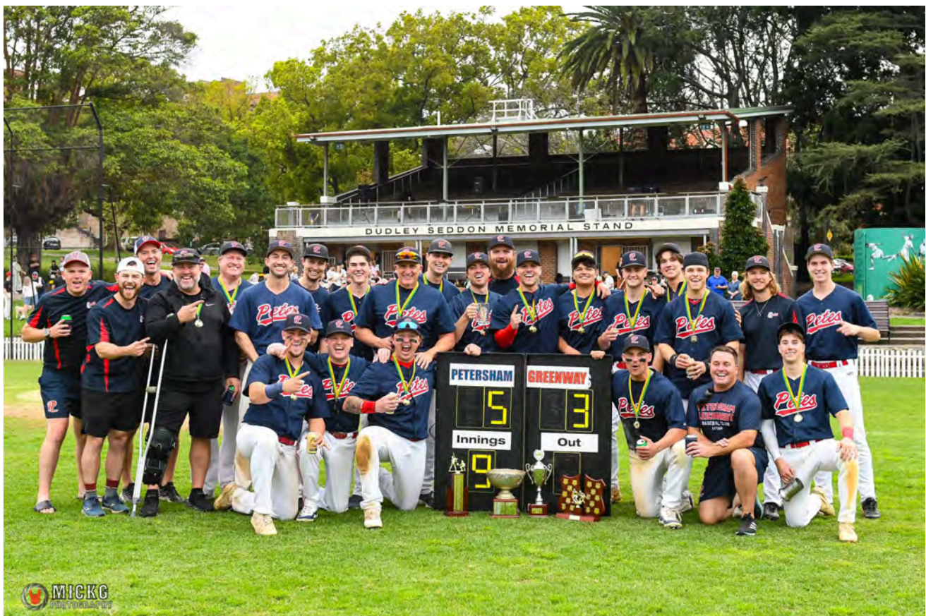
Figure 1: Petersham First Grade Premiers

The Play Off Series was played at Petersham Oval, and we thank the Petersham Club for hosting the Finals, running the canteen and looking after the ground preparation, particularly following the unexpected downpour on the first weekend.