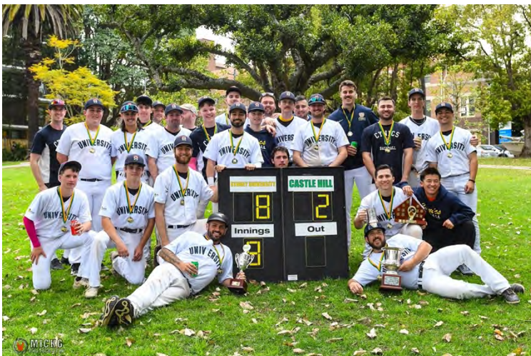
Figure 2: Sydney University - Second Grade Premiers