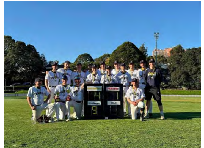
Figure 3: Sydney University – Third Grade Premiers