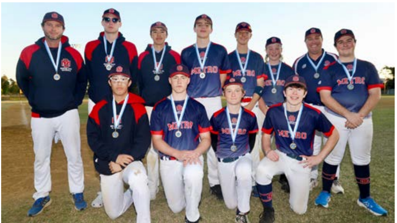
Photo: Brisbane Metro - U16's Division Champions.