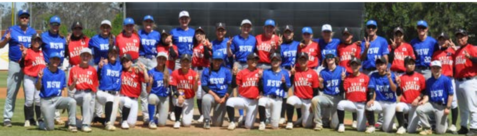
Photo: Orio Aishin Inbound Tour 2023.

The most notable teams from Fukuoka - the SoftBank Hawks and their professional women's team the Kyūshū Honeys - are among the premier baseball teams in Japan. Through the MOU established in August of 2023, Baseball NSW are committed to sharing players, coaches, and touring teams with, in order to further develop and strengthen local players.