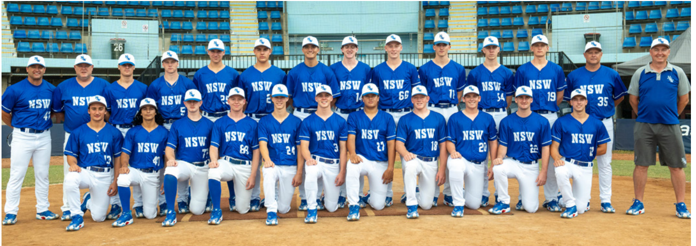
Photo: Australian Youth Championships U18's Metro Team.