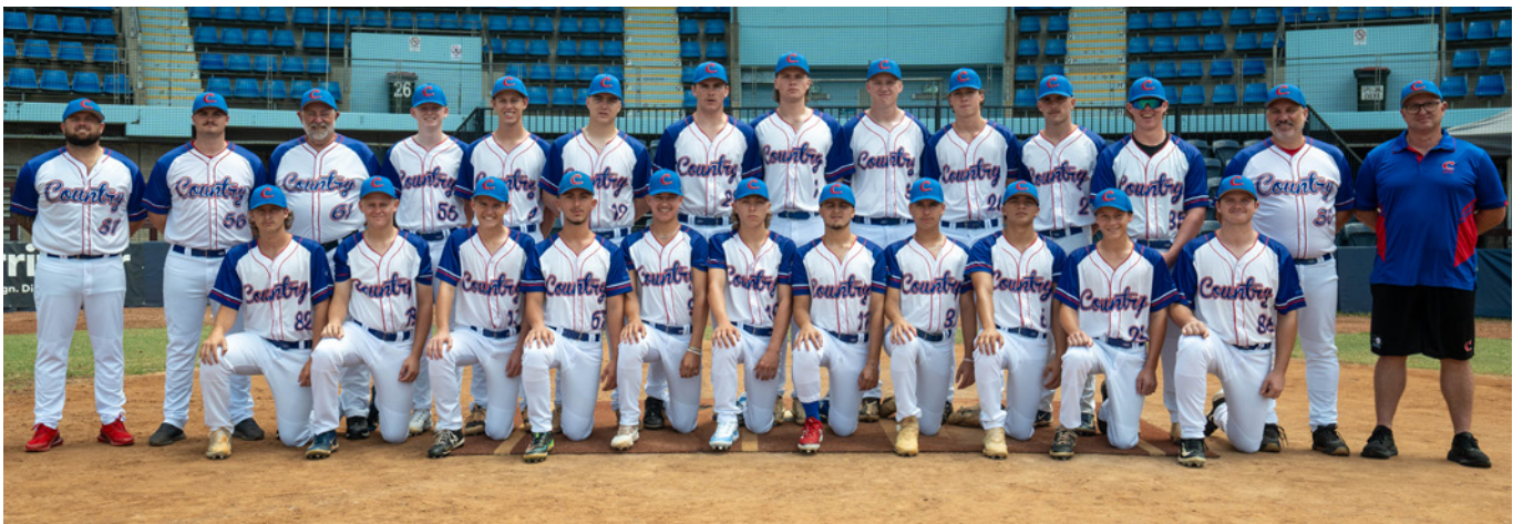
Photo: Australian Youth Championships U18's Country Team.