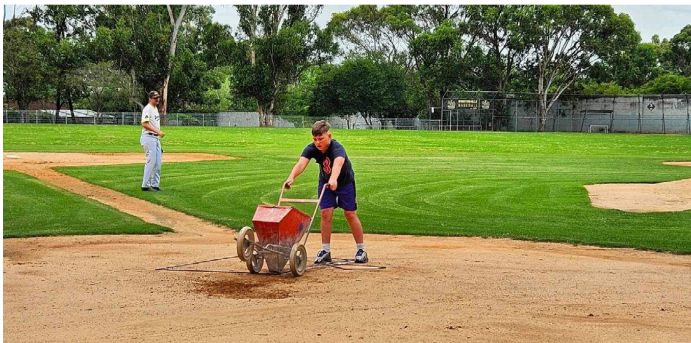
Got to get the field ready for the big game.