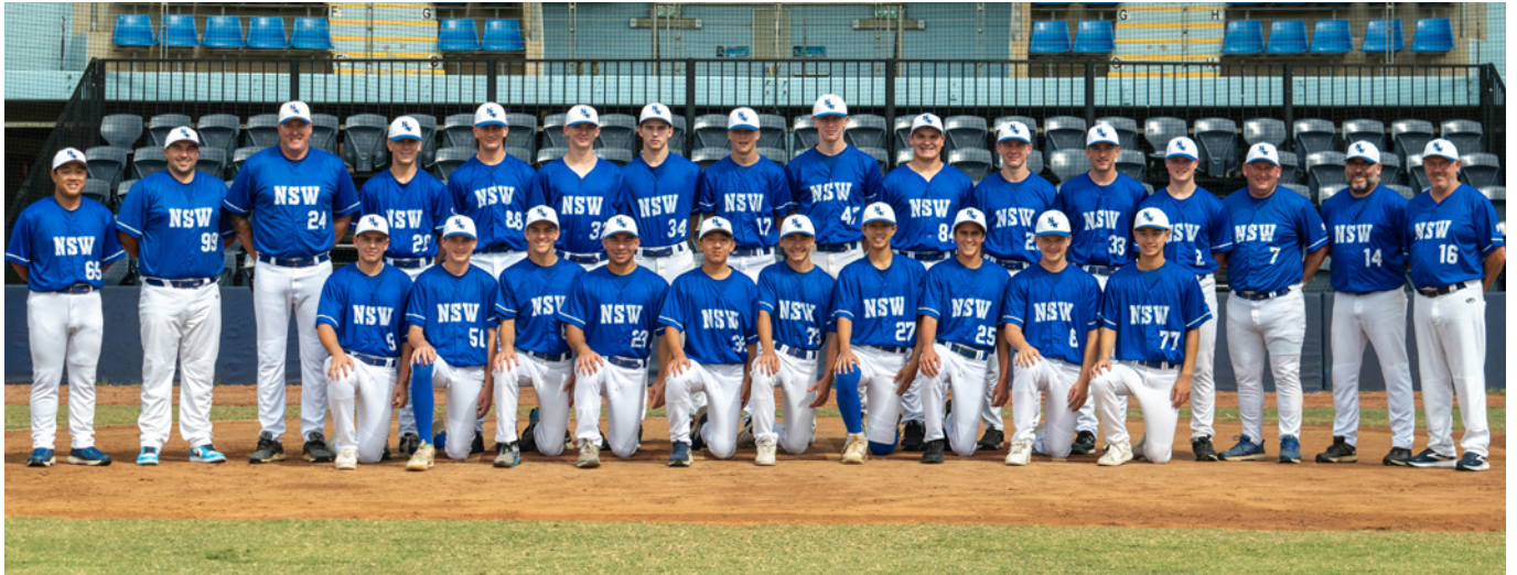
Photo: Australian Youth Championships U16's Metro Team.