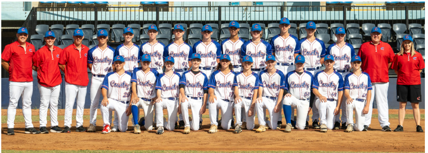
Photo: Australian Youth Championships U16's Country Team.