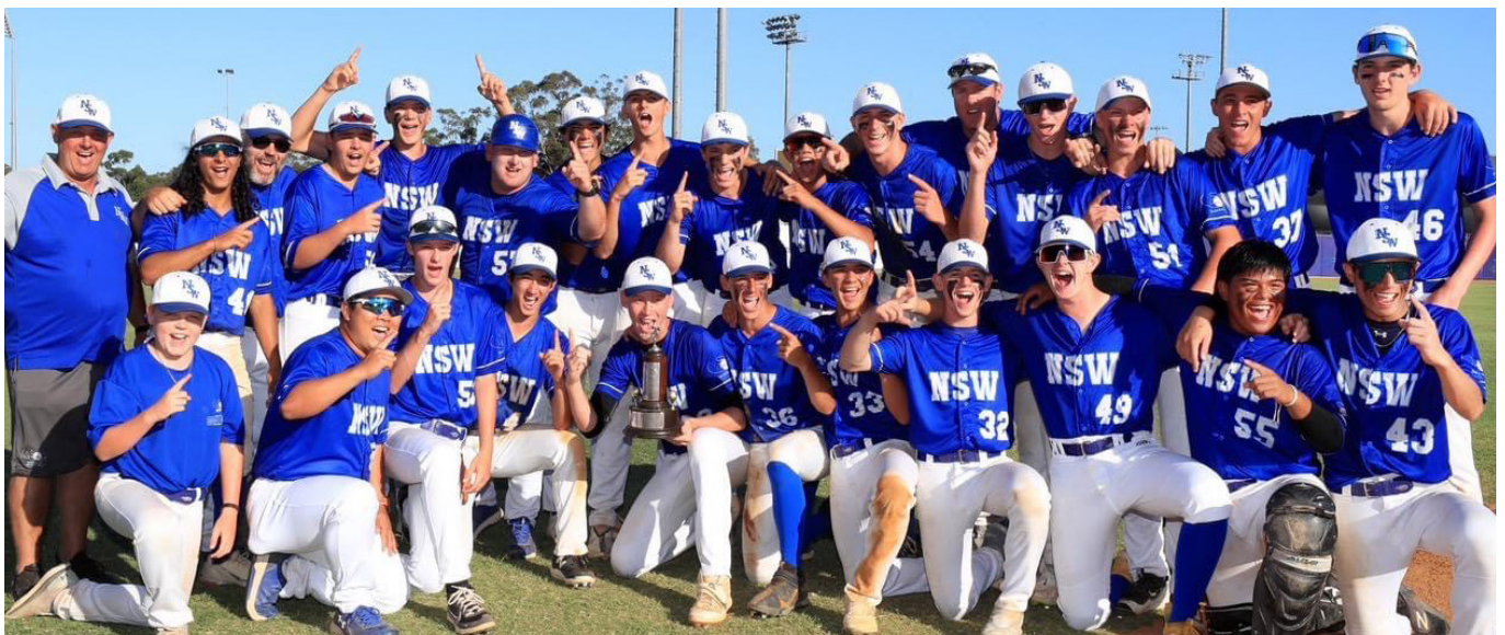
Photo: Metro Under 16's win gold at the 2023 Australian Youth Championships.