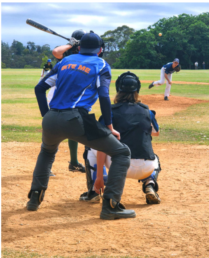
'Don't like my call... Bite Me Bakehouse.'