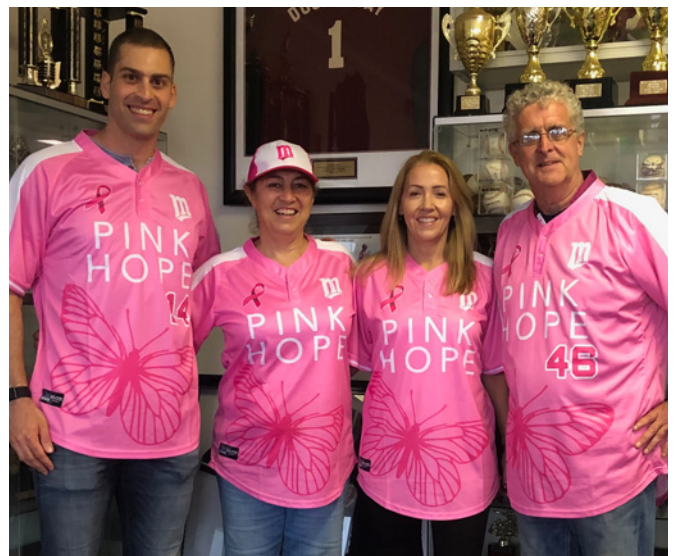
Photo: Manly's Pink Hope Day 2022

LOCATION: Location as per Round 13 on the State League draw is Aquatic Reserve.